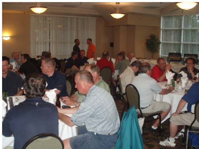
A great day for everyone! The buffet was excellent and was a perfect ending for another great tournament!