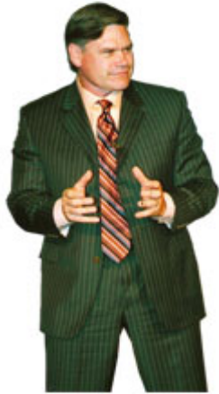
Ryan Walter Stanley Cup Winner Montreal Canadiens Over 1,000 games played in the NHL