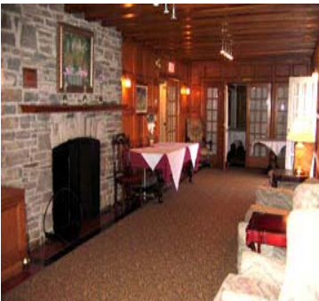
The Grand Hall at the Glenerin Inn

“Seventy percent of success in life is showing up.”