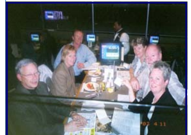
The Jesmar Communications Group!