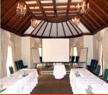
The Evans Room at the Glenerin Inn