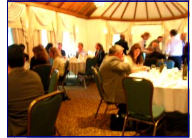
Enjoying the Evening!

We look forward to next year's tournament and hope to see you there!