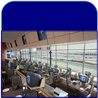
Trackside viewing at Woodbine!