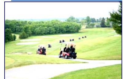
The CLSA golfers take the course!